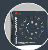
Updated Product Handbook